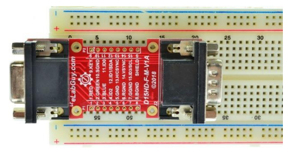
Figure 2: Example of connecting the D15HD-F-M-V1A on a proto PCB (Note: This picture only shows the pins spacing, actual use may not be used on a breadboard)