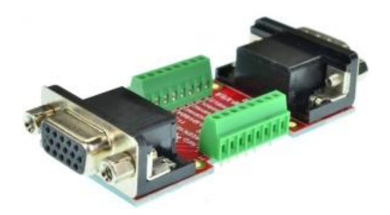
Figure 4: D15HD-F-M-V1A with terminal blocks